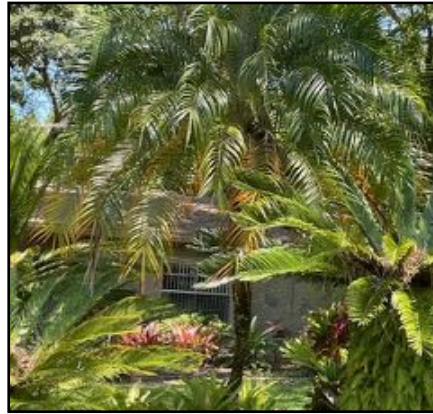
King Sago Palm