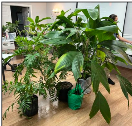
Palms from Ray's Garden