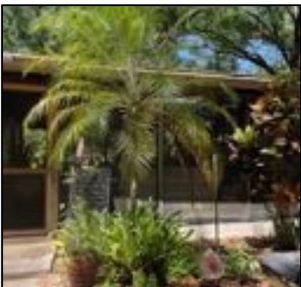
Phoenix roebelenii aka pigmy date palm