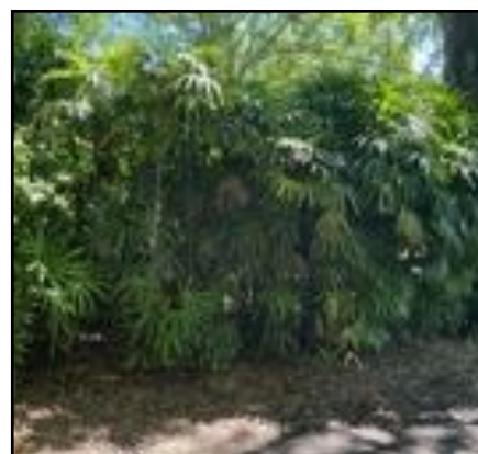
Rhapsis excelsa aka Lady Palm