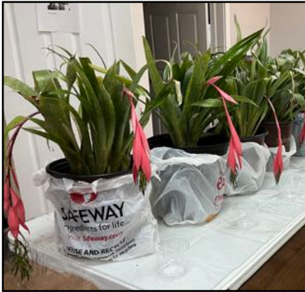
Plants donated by Temple Terrace Garden Club