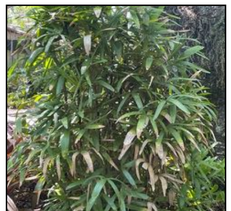
Rhapsis humilis aka Reed Palm