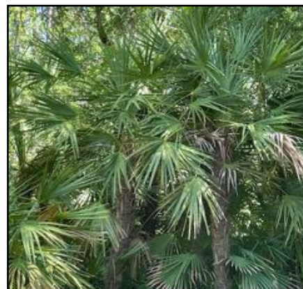
Serenoa repens aka Saw palmetto