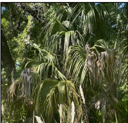
Sabal palmetto aka cabbage palm