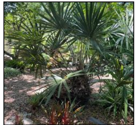
Rhipidophyllum hystrix aka Needle Palm.