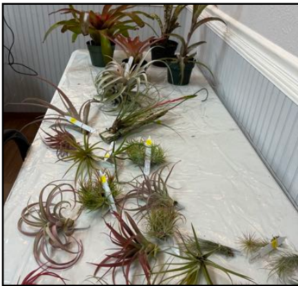
Plant Sale Table